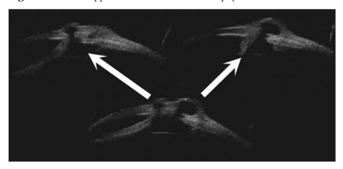
Figure 2. Ultrasound biomicroscopic appearance of staphylomas; scleral defect in the small (long arrow) and the big (short arrow) staphylomas

in a disfigured eye, and reconstruction of a satisfactory vision stands as a big challenge for caring ophthalmologists.<sup>6</sup> To our knowledge, isolated congenital form of anterior staphyloma is quite rare. The pathogenesis still remains unclear, but it is certain that there is a scleral defect, allowing uveal tissue to protrude through the opening.<sup>3</sup> The data obtained from histopathologic and electron microscopic studies suggest that this weakness on the wall occurs during embryogenesis.7 Furthermore, it is postulated that lack of mesodermal differentiation or intrauterine keratitis (either blood-borne or trans-amniotic) may be the causative factors.<sup>8,9</sup> From this point of view, potency of causative agent and the time of insult may be the factors that determine the extension of ocular involvement. Currently, there is no standard classification system for congenital anterior staphyloma regarding severity of the disease. In our case, except for these two black spots, ophthalmologic examination was normal. However,