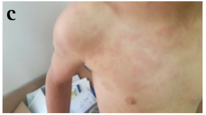
Figure 2. Erythematous and edematous plaques on the patient's right arm (a), left arm (b), and upper trunk (c)