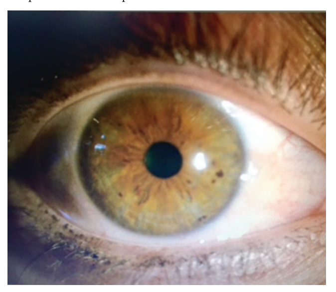
Figure 1a. Inflamed pinguecula in the right eye

He stated that an itchy rash had formed on his trunk and arms the previous day, approximately 1-2 hours after instilling the nepafenac eye drop and he had been treated for allergy that night in the emergency department. A similar reaction had occurred 1-2 hours after instilling the drop that morning and the dermatology department was consulted. Erythematous, edematous plaque lesions were observed on the arms, neck and abdomen on dermatologic examination and the patient was diagnosed with allergic urticaria by the dermatologist (Figure 2a, b, c). The dermatologist instructed the patient to discontinue the nepafenac drops and prescribed oral antihistamines to treat the urticaria. The ophthalmology department recommended preservative-free lubricating drops and scheduled the patient for follow-up. At follow-up three days later, the patient's skin lesions and symptoms had completely regressed and his ocular complaints had also improved.