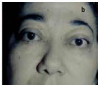
Figure 1. A patient before (a) and 3 months after (b) orbital radiotherapy